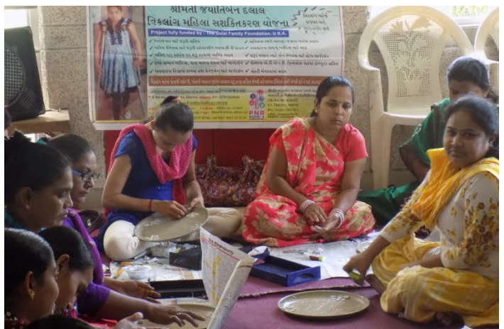
Photo of Craft Training

Out of 85 forms received, there are 20 from Bhavnagar under Smt. Jyotiben Dalal Empowerment of Disabled Woman Project and they were visited and counseling was done according to their interest. The rest residing in villages are being contacted.