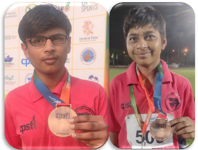
National CP Sports Winners