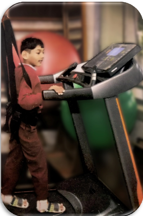
Accelerated Movement Training