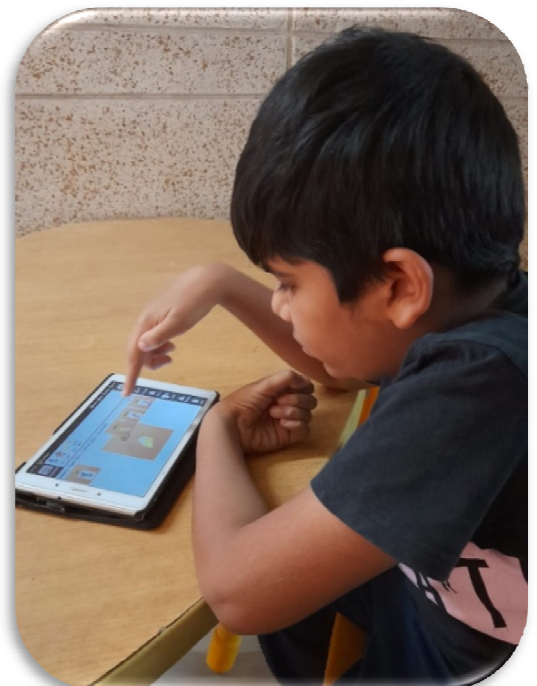
Awaz Ap Training for Conversation. (Happy conversation within family, school and society)