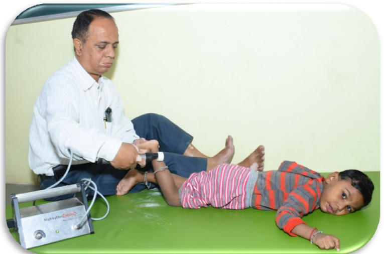
Matrix Rhythm Therapy